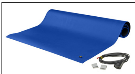
8900 Table Mat Kit shown with included hardware